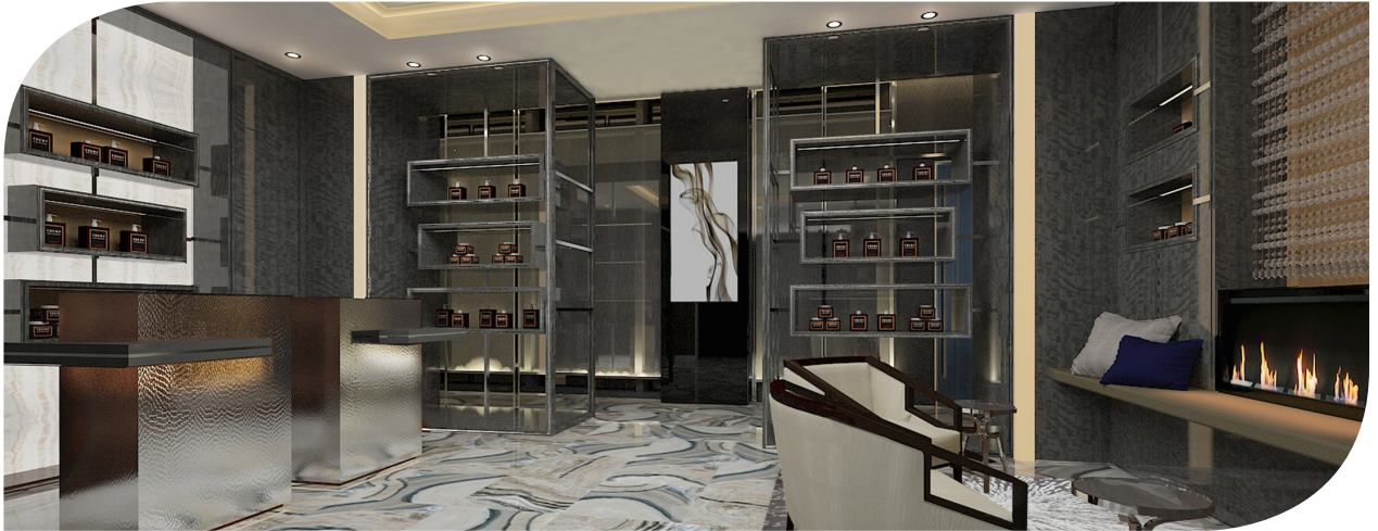
TRUMP INTERNATIONAL HOTEL & TOWER, VANCOUVER, BRITISH COLUMBIA, CANADA INTERIORS DONE BY: MCM INTERIORS. ANTICIPATED FINISHES, BUT ARE SUBJECT TO CHANGE.

The spa and fitness facility at the brand new MGM National Harbor luxury resort on the banks of the Potomac River in Maryland features a full-service spa and salon with men's Barber Lounge and fitness centre. WTS designed the spa concept and handled all the pre-opening and ongoing management.